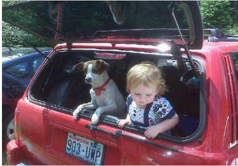
Successful Adoption! Shirley and her new adopted human.