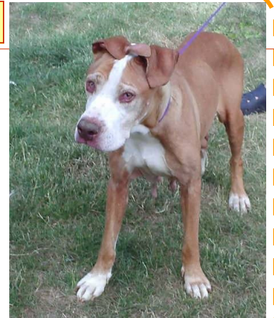
Sassy Sue just after she was rescued

diarrhea. The vet said her heart is strong and is one happy dog, and is still amazed at how far she has come from the first day he saw her in the parking lot. She cannot yet be made available for adoption until her health issues are resolved. Because of severe neglect from a previous owner, her future is still uncertain. But we won't give up on her, not when she has fought this hard to still be alive. Because her medical bills are expensive, YVPR is asking for donations to help us help her. Thank you!